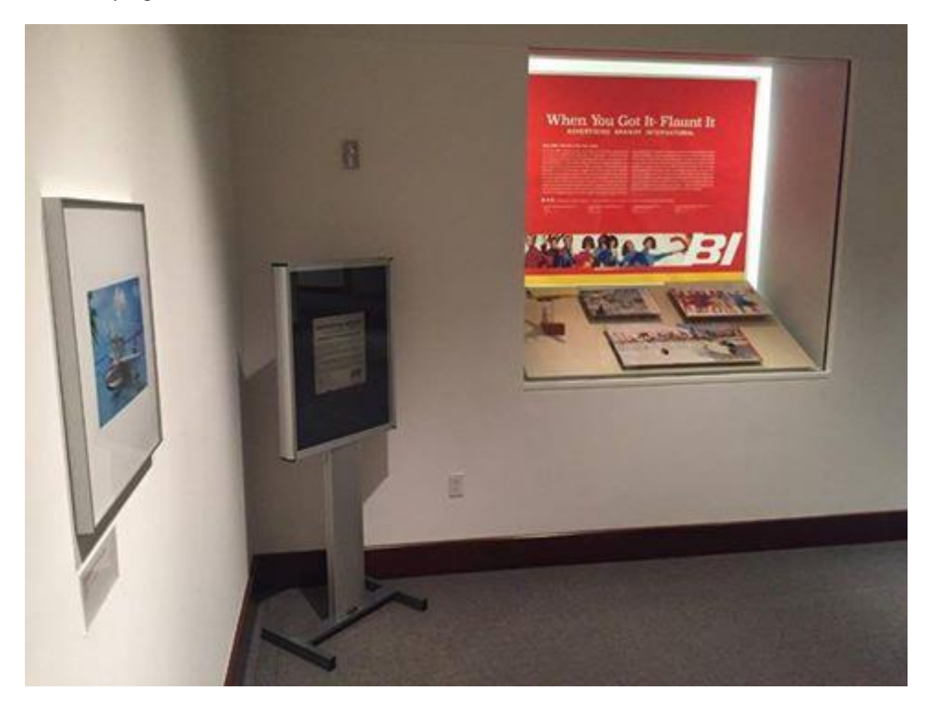
Photo: Private Collection, Copyright Braniff Flying Colors Collection, Curator

Braniff Airways Foundation Copyright 2012 2017